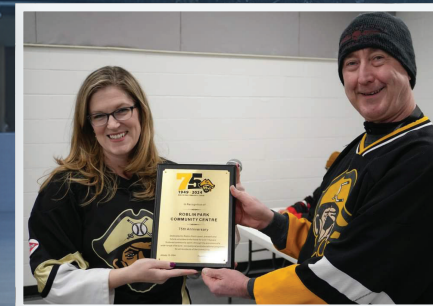
Roblin Park 75th Anniversary Plaque Presentation