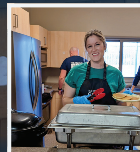
Phoenix Winter Carnival pancake breakfast in Headingley