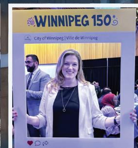
State of the City Address