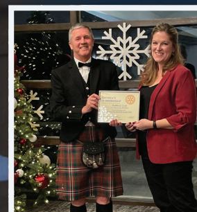
Winnipeg Charleswood Rotary Clubs Annual Christmas Dinner