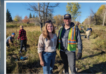
Planting Trees with Friends of the Harte Trail