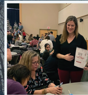
Headingley Community Pancake Breakfast in support of Bright Beginnings Educare