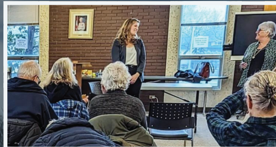
Charleswood Active Living Centre Coffee and Conversation