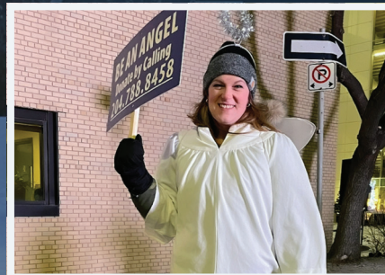
Annual Angel Squad Fundraiser with Misericordia Health Centre