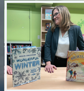
Visit to Headingley Library