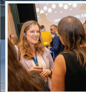
Manitoba Chamber of Commerce Holiday Mixer