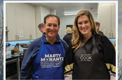
Roblin Park Community Pancake Breakfast with MP Marty Morantz