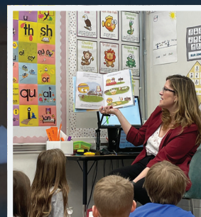
I Love to Read - Beaumont School