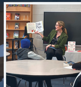
I Love to Read - École Charleswood School