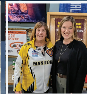
Team Manitoba send off to Nationals at the Charleswood Curling Club